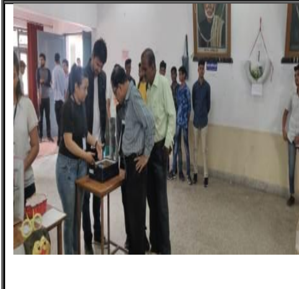
Students explaining the model to faculties